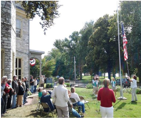
A Star-Spangled Celebration, September 2014

and open house, during which a replica 1814 flag was raised by local girl scouts on our newly refurbished flag pole, accompanied by the singing of the Star-Spangled Banner by professional musicians. The Star Spangled Banner activities were sponsored by the Dauphin County Commissioners.